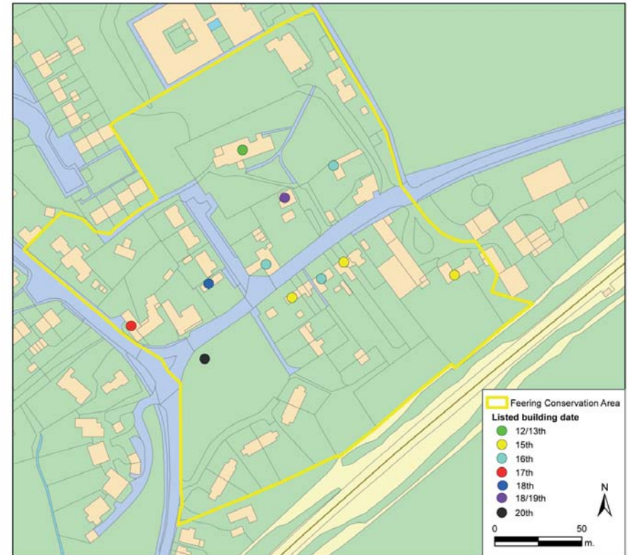
Figure 2 Distribution of Listed medieval buildings within Feering

Quantities of medieval pottery were recovered during the development of the Drummond Centre to the north of the church and it can be presumed that the medieval settlement area included this site.