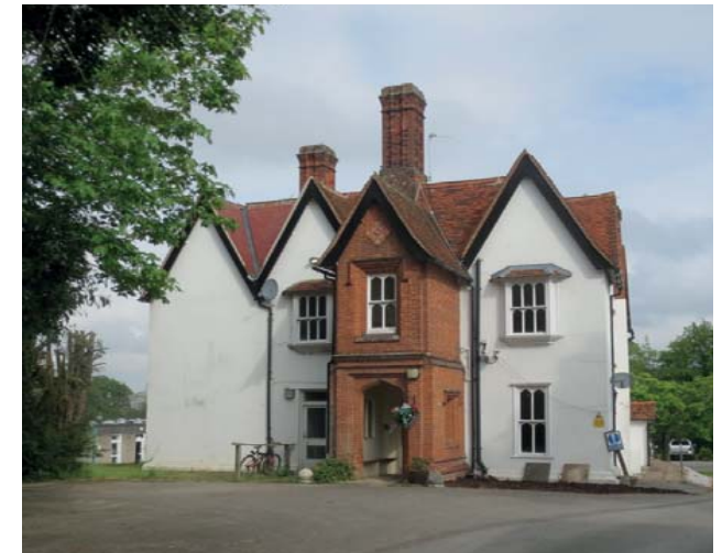
Figure 13 The Old Vicarage, though heavily altered, provides an interesting link to the historic usage of the land to the north of All Saints Church, now occupied by the Drummond Centre