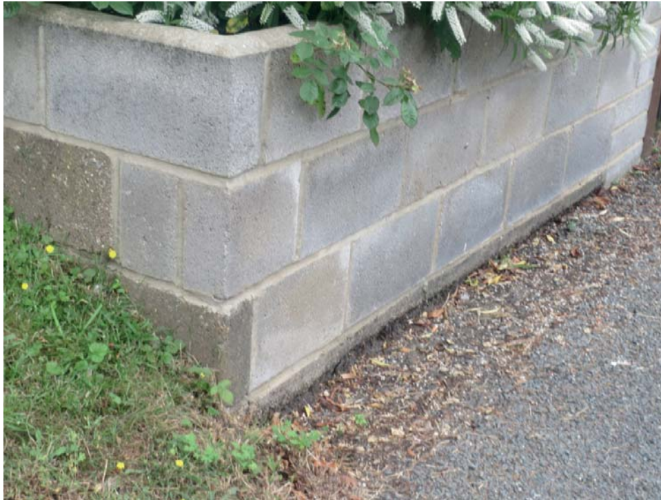
Figure 14 Example of intrusive modern boundary treatment