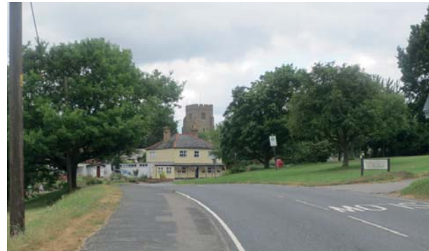
Figure 17 View from the railway bridge into the Conservation Area