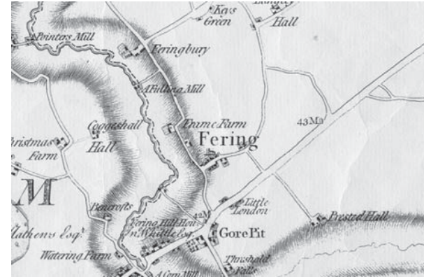
Figure 3 1777 Chapman and Andre map of Feering area

The settlement has developed slowly during the modern period. Its location, set back from the main road and away from Kelvedon, has left it essentially a small rural village in character and not subject to the extensive development which occurred elsewhere. In the post-War period retirement cottages were constructed to the south-west of the church and on the southern side of the Green. The Rectory site became the Drummond's Centre for adults with learning or physical disabilities in the 1950s. A small development of twentieth century council houses are located on the north western boundary of the settlement in the mid twentieth century, outside the Conservation Area. Similarly, there has been some development of land west of Coggeshall Road in recent decades.