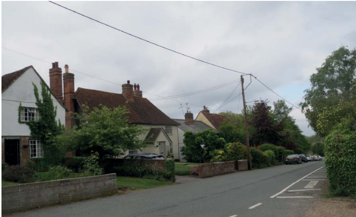
Figure 10 View looking west along The Street, showing differing roof forms and building materials

Half hipped and gambrel roofs, as well as traditional gables create a varied appearance to the roofscape throughout the Conservation Area, with gaps between allowing for views out into the surrounding landscape and toward the church. The buildings vary in height from single-storey with attics to two-storey with attics; All Saints Church is the tallest building within the village and a distinctive marker in the surrounding landscape. New development is low in height and does not obscure or dominate older buildings. Roofing materials include tile and slate, dependent on the relative age of the property. There are also a wide range of chimney styles; these add variety to the interesting roof-scape in the centre of the village.