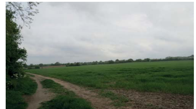
Figure 20 View from eastern edge of Feering Conservation Area into wider rural landscape

It is important that these views are considered in proposals for new development or extensions to existing properties. Any proposed development located behind other buildings and cannot be seen from the main roads should still be carefully considered as it may have a detrimental effect from other viewpoints.