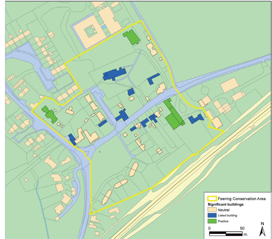
Figure 7 Feering Conservation Area showing significant buildings

Within the Conservation Area, the late medieval and post-medieval housing stock is in good condition. These buildings contribute positively to the aesthetic experience of the Conservation Area, which is typical of rural villages across Essex and the South East. A variety of traditional building materials are found throughout the village, providing visual interest and reflecting the vernacular nature of much of the building stock. Buildings range in date from the 14th to the 19th centuries, with minimal infilling over the centuries adding to the richness of the built environment. The roofscape is varied in pitch but not height, with properties ranging in height from one and a half storey cottages to two storey houses. Where there has been some modern infill, this mostly comprises of retirement cottages which are modest in scale. These are concentrated on the southern side of The Green and to the west of the Church. Developments outside the Conservation Area boundary are also mostly small in scale and have not had a negative impact upon the core characteristics of the Conservation Area.