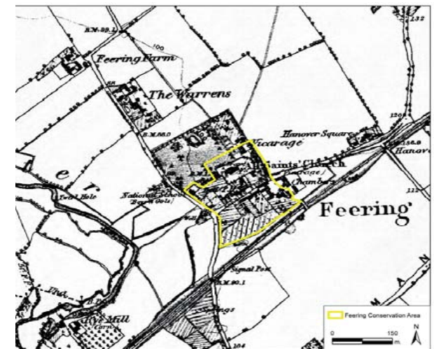
Figure 4 (Above) 1st edition OS 6" map, 1881 showing the railway line and the rural setting of the village