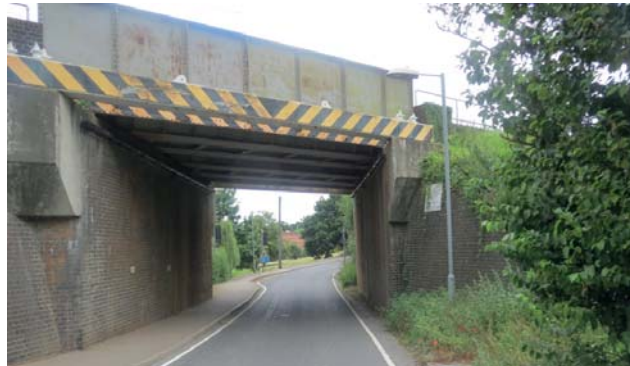
Figure 16 View through the railway bridge