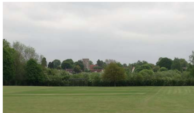
Figure 19 View from Kelvedon and Feering Cricket Club to Feering Conservation Area

The positioning of the village on the edge of the Blackwater Valley has also enabled significant views towards the settlement from the wider landscape, these include the view from the Kelvedon and Feering cricket-club across the Blackwater to the church and the surrounding collection of trees and cottages, as well as from the bridge over the railway to the east of the Conservation Area.