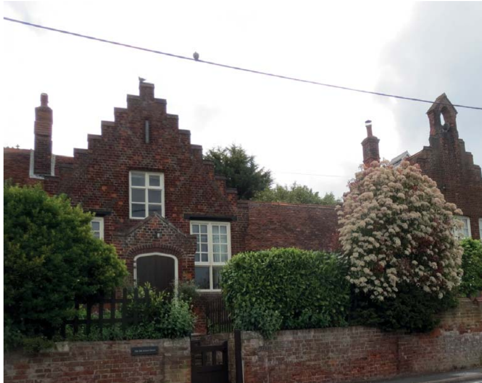
Figure 6 The Old School, Coggeshall Road