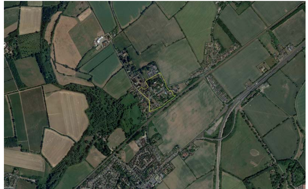
Figure 5 GoogleEarth image highlighting the wider rural setting of the Conservation Area

The land use today is predominantly arable but the numerous small areas of woodland, together with the trees in the hedgerows, give an impression of it being more wooded. The trees species are mainly oak, ash and hornbeam, with willows along the river. The river is bordered by areas of marsh, and Feering Marsh is a Local Wildlife Site (BRA234). The field pattern, together with the pattern of lanes, footpaths and isolated farmsteads is historic in origin and in many cases derive from the medieval period. There has been hedgerow loss, but the overall grain of the historic fieldscape is still legible.