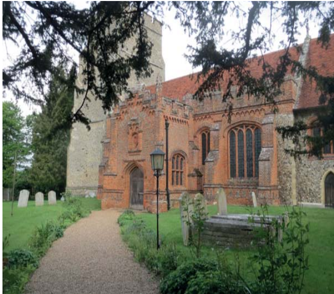
Figure 11 All Saints Parish Church