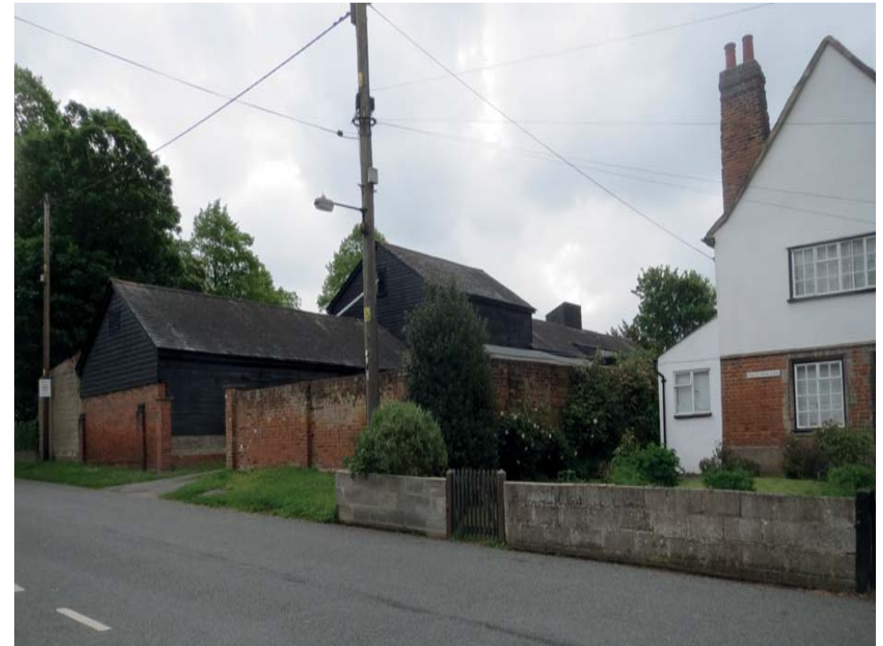
Figure 9 The building materials used on the Barns at Church Farm and Church Farm cottages are typical of those found in most Essex villages

There is also a wide variety in the style of doors and windows, all of which are important in maintaining the character of existing buildings. Despite the variety, windows and doors are predominantly traditional in appearance. uPVC windows are not a notable features of the Conservation Area, nor are they prominent where they are in place; the installation of modern uPVC windows would be considered inappropriate. There are a number of buildings with interesting architectural features, such as the entrance to Wallberswick House and the slate roofed veranda on Sunnyside, The Street.