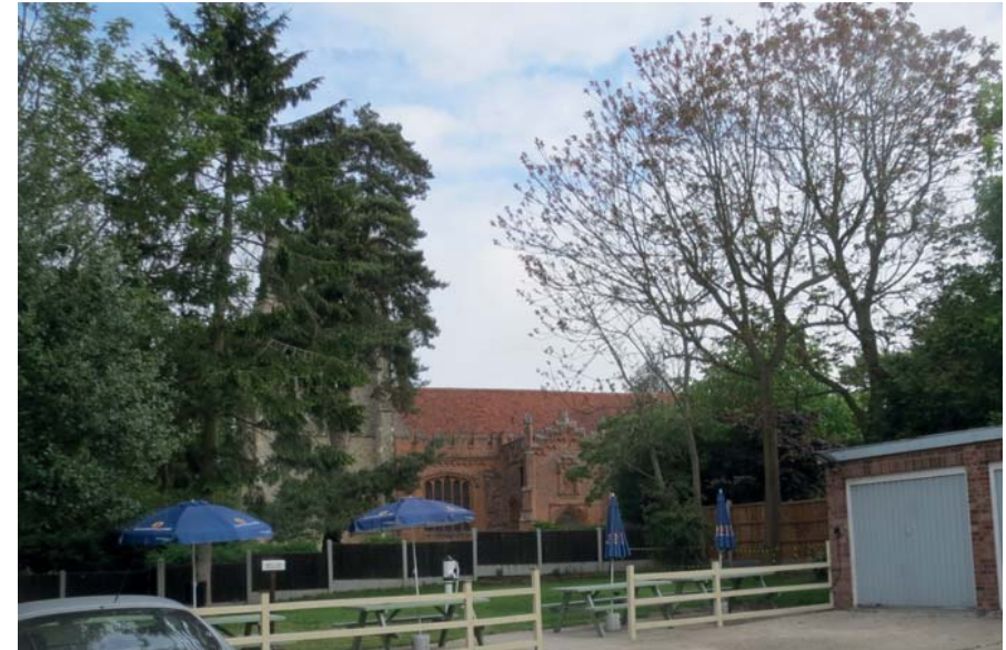
Figure 21 The garden space to the rear of The Bell Inn positively contributes to the open appearance of the Conservation Area and enables views into the Church

The village green forms an important area of open space within the village. Its influence on Feering is particularly noticeable when viewed from the railway arch entrance into the Conservation Area. Here the village opens out to form the green with its historic buildings and church behind it and open views to the west into the Blackwater Valley (see Figures 15 and 17). In addition, many of the residential buildings have small front gardens that can be easily viewed from the road, and these combined with the open space of the graveyard and its mature trees contribute to the rural, well-vegetated appearance and character of the village.