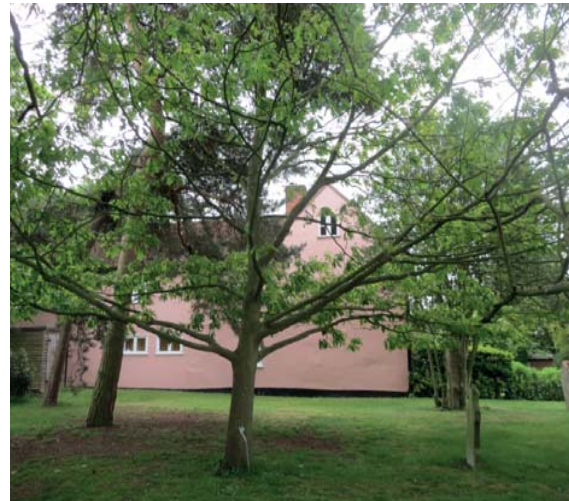
Figure 12 The former guildhall of Church Gate House as seen from the graveyard

The Old School, Coggeshall Road, has its origins as a National School for Boys and Girls in the late nineteenth century. It is a red brick structure with an interesting roofline, representing several phases of building on the site. It should be a candidate for Local Listing following further research. The Old Vicarage in the Drummond Centre, although much altered, also contributes to the overall understanding of the Conservation Area and is associated with the artist John Constable who stayed there. It is a Victorian building, with a polychrome plaque on its southern elevation and is distinctive against the utilitarian twentieth century style of the rest of the Drummond Centre.