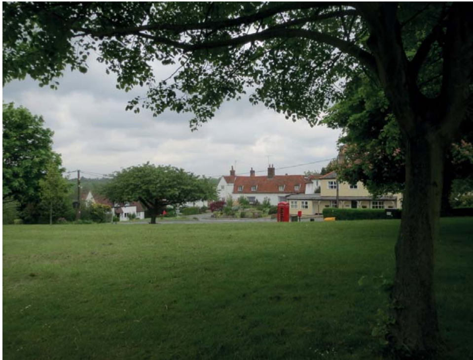
Figure 8 View looking across the village green to The Street

The historic core of the Conservation Area is built on a gentle slope on the eastern side of the Blackwater Valley. The church stands on the highest point, and although this is not particularly noticeable within the village, it means that it forms a prominent local landmark when viewed from a distance, particularly from the western side of the Blackwater Valley. The street pattern, changes in levels and distribution of open spaces enables an interesting succession of views, both within the settlement and out into open countryside. These views contribute positively to the overall character of the Conservation Area, reinforcing its rural setting and traditional linear development.