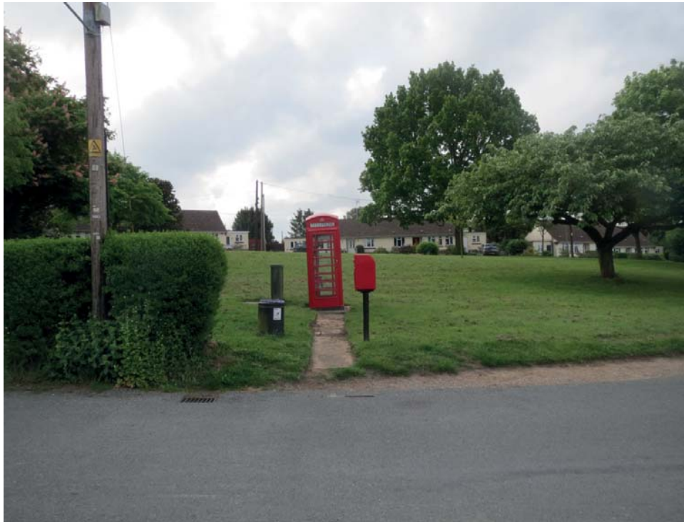
Figure 22 Over proliferation of street furniture in this section of the village green detracts from the appearance of the Conservation Area

The following key issues have been identified and are summarised below in brief. The list is in no way exhaustive and neither are the issues identified unique to Feering, with many being shared with other Conservation Areas.