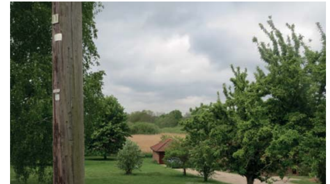
Figure 18 View from southern corner of Feering Conservation Area into the Blackwater Valley