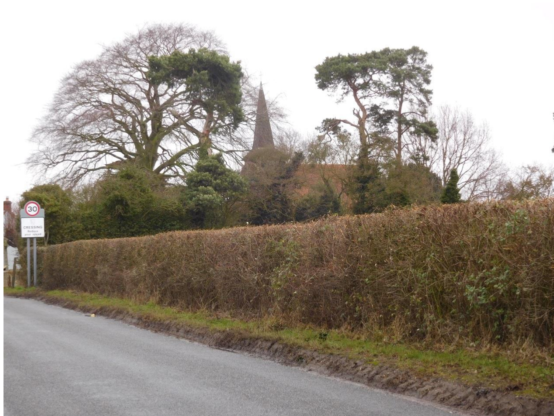
Figure 9 – Church Road with view of Cressing Church (CRESSLANE8)

Views – notable views, which are particularly scenic, unusual or which include contemporary historic features of note e.g. a parish church, listed building, farm complex or landscape that are framed by the lane and/or its associated vegetation were identified.