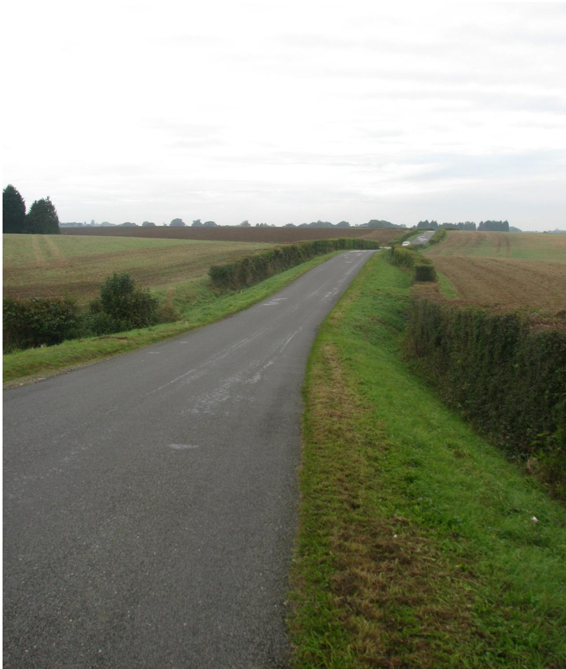
Figure 3 - Verges on undulating lane at Shalford Road (BTE Lane 24)