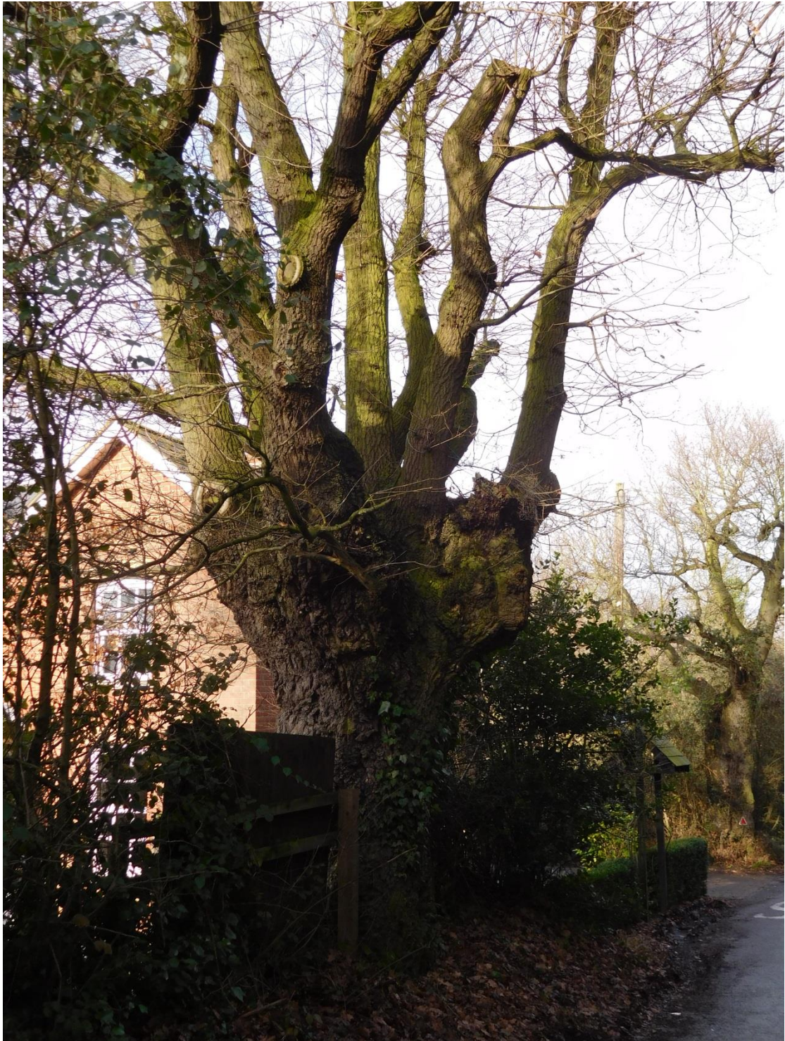
Figure 5 - Veteran pollard (CRESSLANE2)