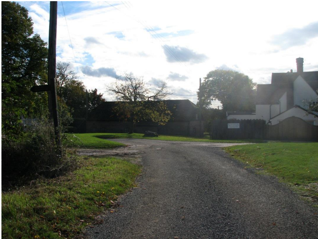
Figure 8 - Greens at Codhams Lane forming part of the important historic settlement associated to this short length of lane (BTE Lane 28)