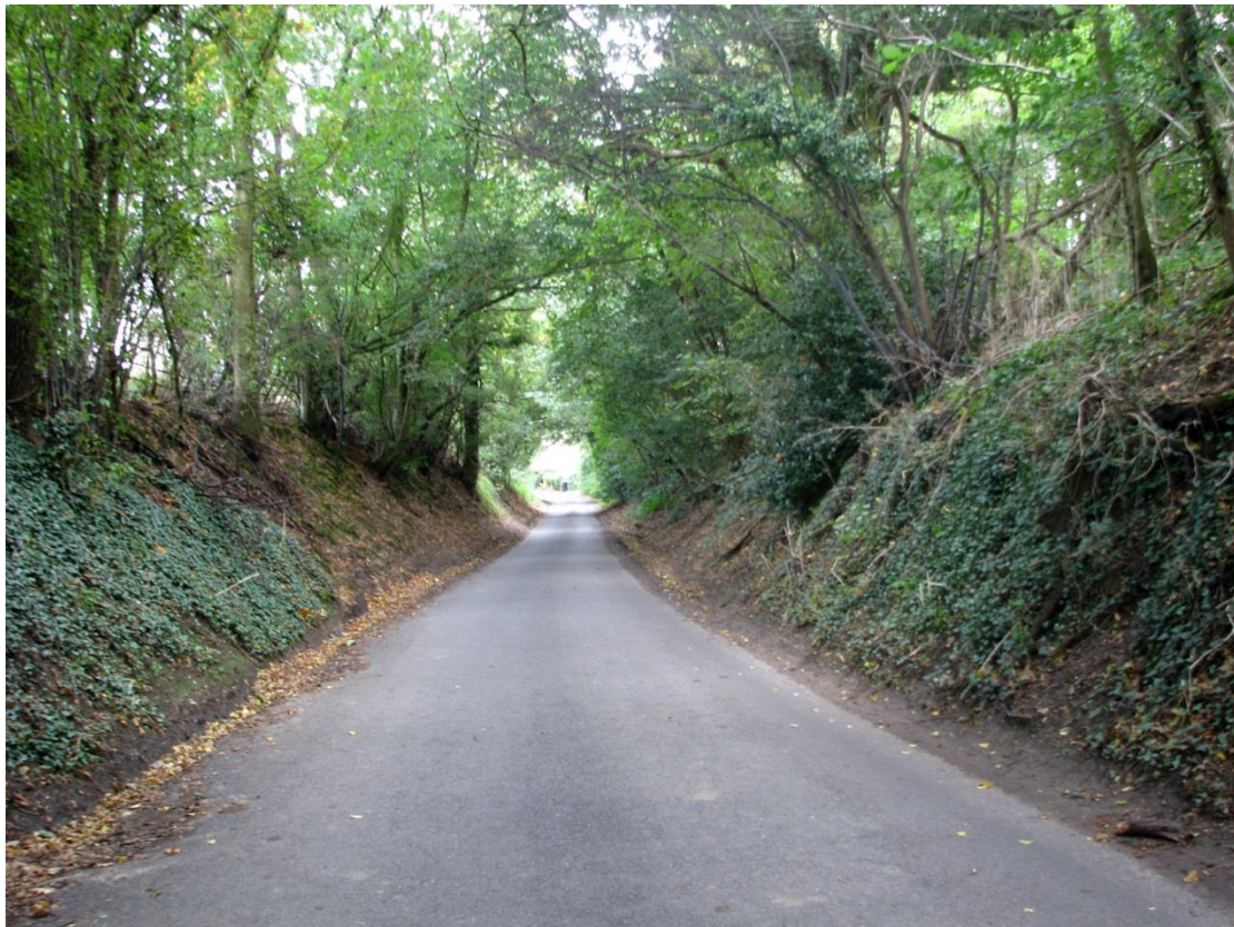
Figure 4 - Sunken lane at Hulls Lane (BTE Lane 35)