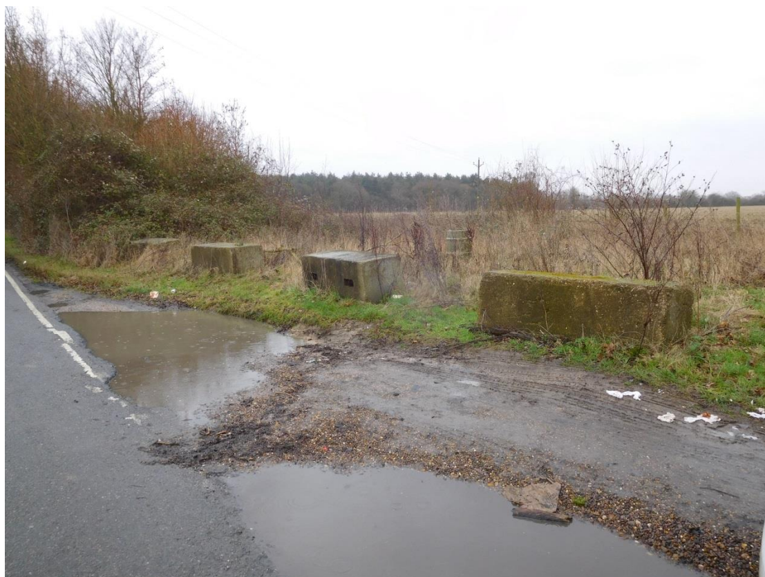
Figure 6 - Shows area of erosion in an area used for parking, with concrete blocks at field entrance (CRESSLANE5)

Description of erosion damage – this was a description of erosion damage to the structure of the lane from vehicular traffic along the length of the unit of assessment. The description included information on damage to banks, verges and surfaces.