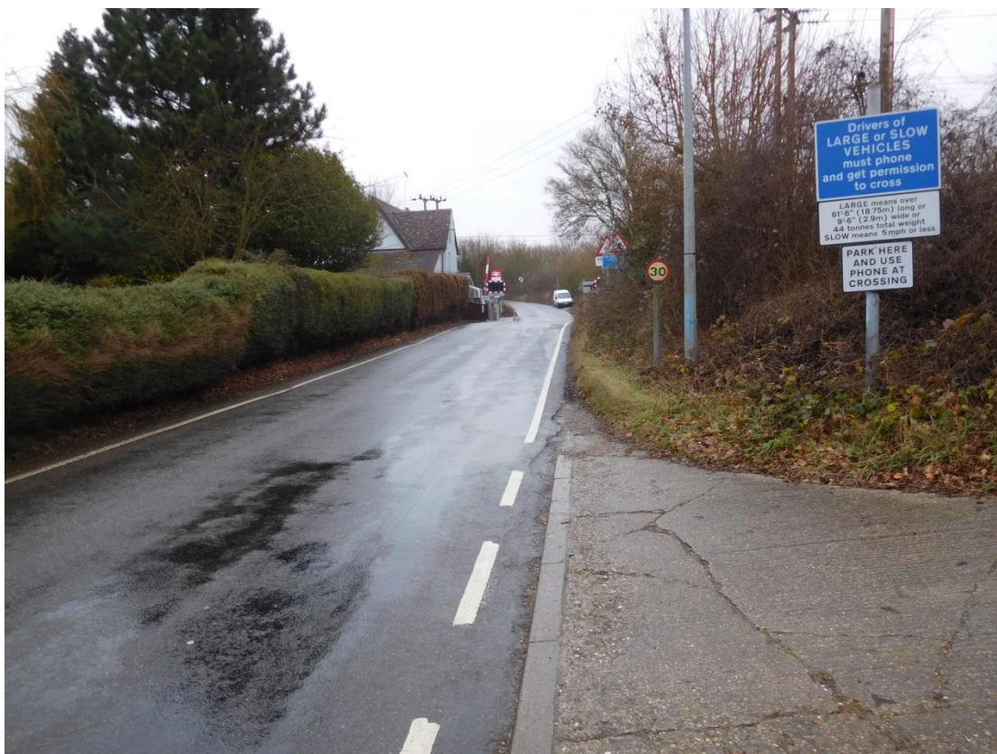
Figure 7 – Station Road showing improvements of kerb stones and road signs (CRESSLANE5)