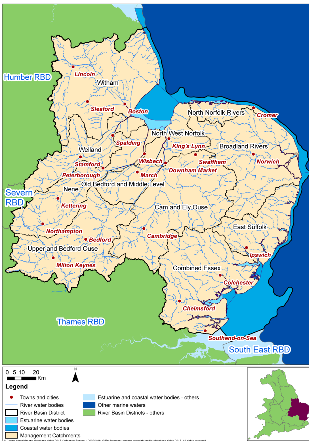
Figure 2: Management catchments within the Anglian river basin district

Catchment partnerships are a major initiative to encourage local action to protect and enhance the water environment. The catchment based approach allows flexibility in the geographic scale at which catchment partnerships operate. Most catchment partnerships operate at the water ‘management’ catchment scale. Some operate at a smaller catchment scale. The partnerships consist of a wide range of stakeholders with an interest in the water environment. This includes, but is not limited to, local government, angling interests, wildlife organisations, water companies, land managers, business representatives and government agencies. Figure 2 shows the management catchments in the river basin district.