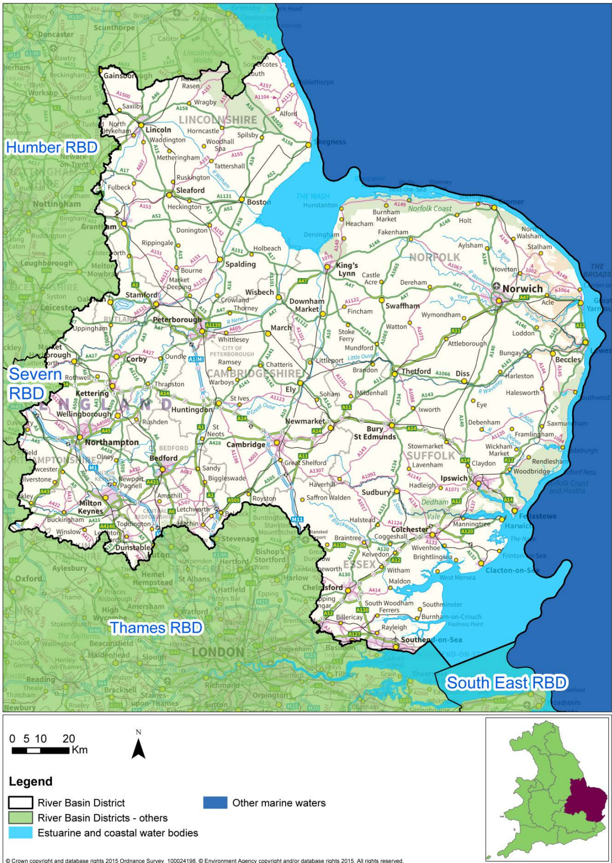
Figure 1: Map of the Anglian river basin district